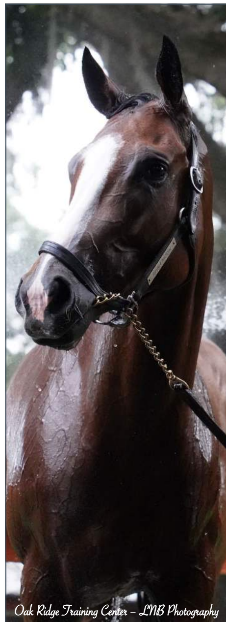
Oak Ridge Training Center