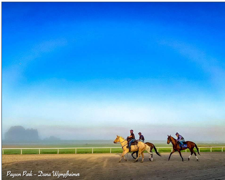
Payson Park – Dana Wympfheimer