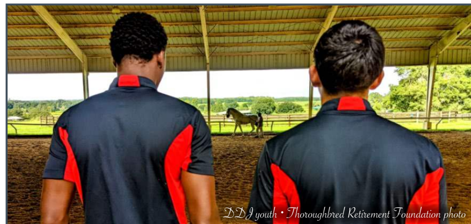
DDJ youth